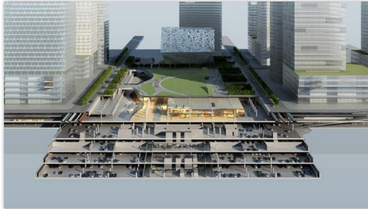
Figure 2 Schematic diagram of underground space in CBD core area

logistics distribution of the building. As a result, the logistics integration of above ground and underground areas in CBD can greatly reduce the logistics transportation cost in CBD area, solve the problem of chaotic logistics distribution in CBD area, alleviate the above ground traffic pressure in CBD and solve the traffic congestion caused by logistics transportation [7].